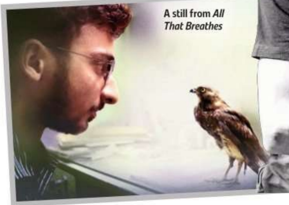
A still from All That Breathes