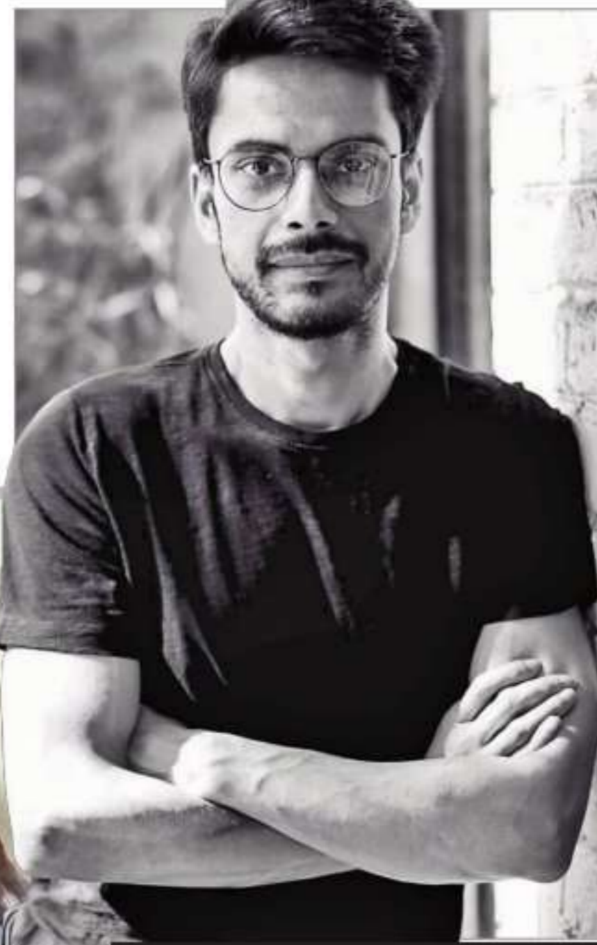
Shaunak Sen is in the World Cinema Documentary Competition panel; (right) Mira Nair will be in the World Cinema Dramatic Competition panel

Filmmaker Mira Nair and documentary director Shaunak Sen have found a place on the jury panel of the Sundance Film Festival 2024, slated to take place January 18-28 in Utah's Salt Lake City. In 2022, Shaunak's film All That Breathes premiered at the Sundance fest, where it won the Grand Jury Prize in the World Cinema Documentary Competition. At the 40th edition of the fest this year, Mira will be in the World Cinema Dramatic Competition panel while Shaunak has been invited to be a part of the World Cinema Documentary Competition jury.